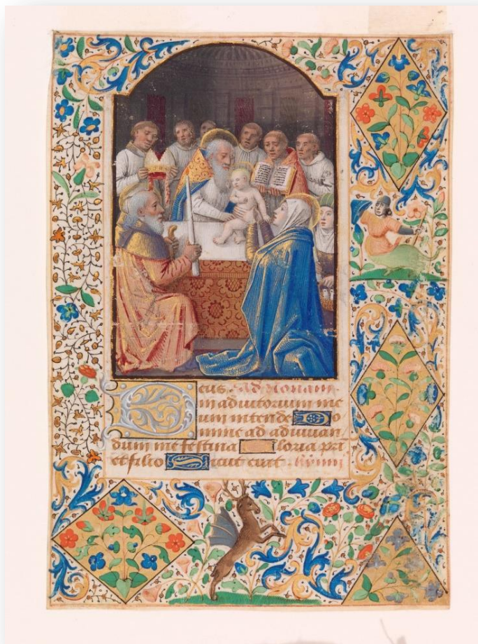
“Presentation of The Lord” Illuminated Manuscript