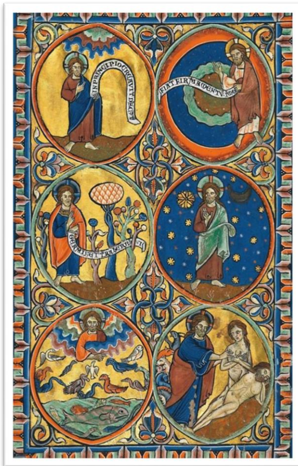
“Creation” Illuminated Manuscript